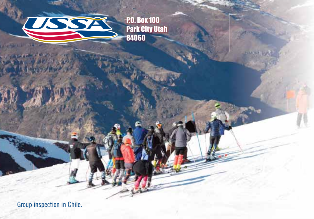
Group inspection in Chile.

Non profit U.S. Postage PAID 4753 Salt Lake City