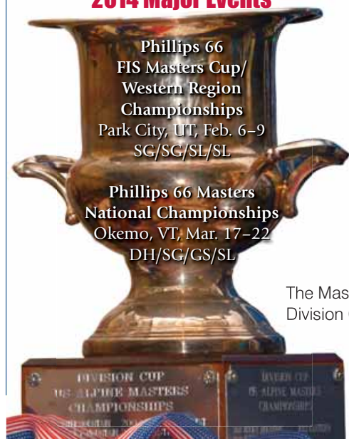
The Masters Division Cup

Phillips 66 Masters National Championships Okemo, VT, Mar. 17-22 DH/SG/GS/SL