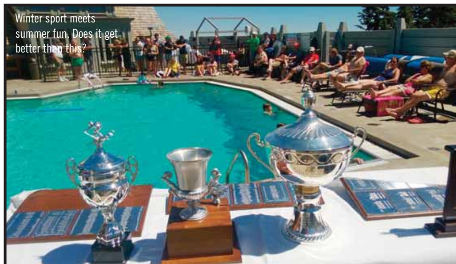
Winter sport meets summer fun. Does it get better than this?

summerfunnationals.com, and more photos are at brianrobbphotos.com.