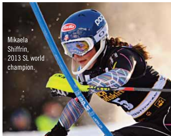
Mikaela Shiffrin, 2013 SL world champion.