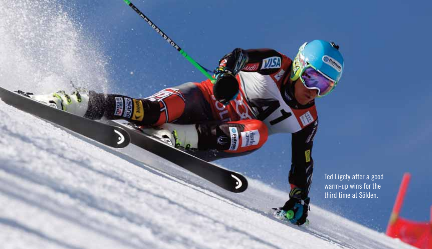
Ted Ligety after a good warm-up wins for the third time at Sölden.