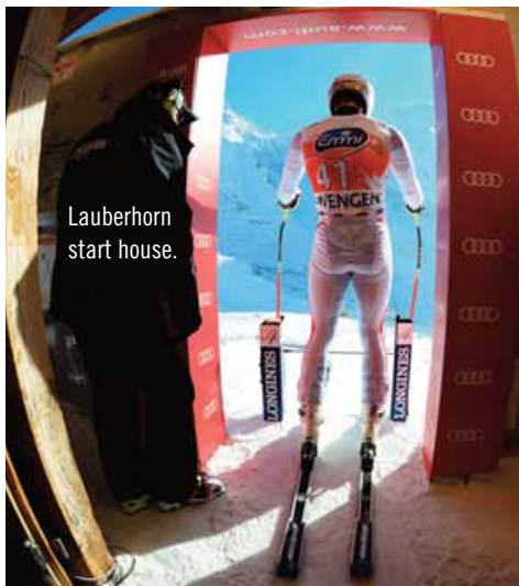
Lauberhorn start house.

Have a ritual that reminds you that your helmet is buckled, goggles are pulled down, armor is secure and boots are