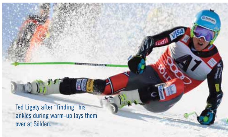
Ted Ligety after “finding” his ankles during warm-up lays them over at Sölden.

Felix Neureither both like to warm up with pivoting exercises knowing that their rotary skills will be taxed after they explode out of the start house.