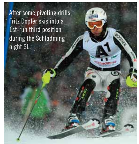
After some pivoting drills, Fritz Dopfer skis into a 1st-run third position during the Schladming night SL.

Start your physical warm-up by getting blood flowing to the muscles. This is essential for fast, accurate movements. Technique will falter and reflexes will be slow if the body is not warmed up sufficiently. Move through full ranges of motion but do not hold stretches—this is not the time to work on increasing joint range-of-motion. Proprioception is enhanced by skiing. Drills